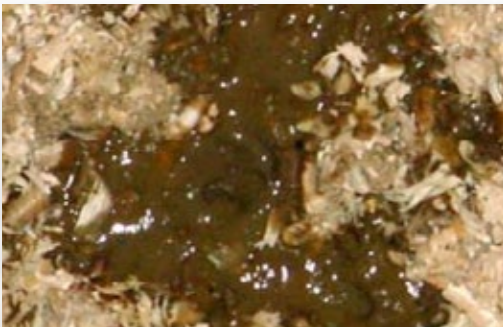
Mix of liquids with some solids