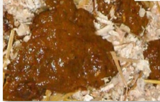
Soft and formed to pasty